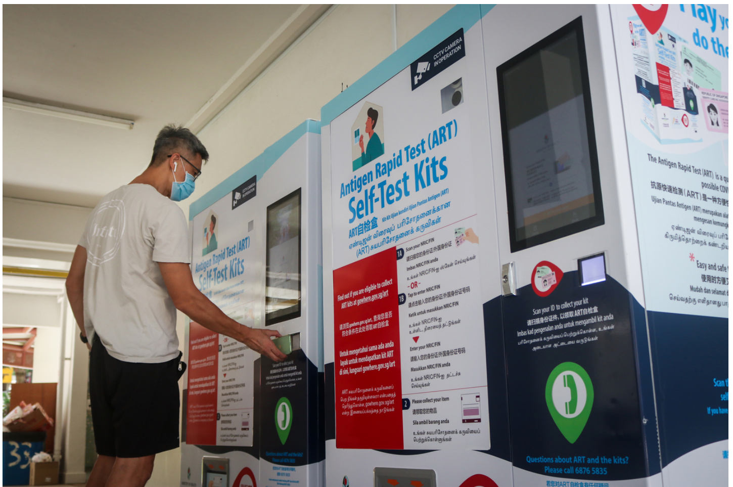
Vending machines for people to collect their self-test kits at Block 33 Bedok South Avenue 2.

The Ministry of Health (MOH) said last week that it has deployed 100 vending machines to 56 locations across the island so that an individual who receives an SMS from MOH informing him that he is required to do a self-test can collect a pack of three ART kits from a location near him.